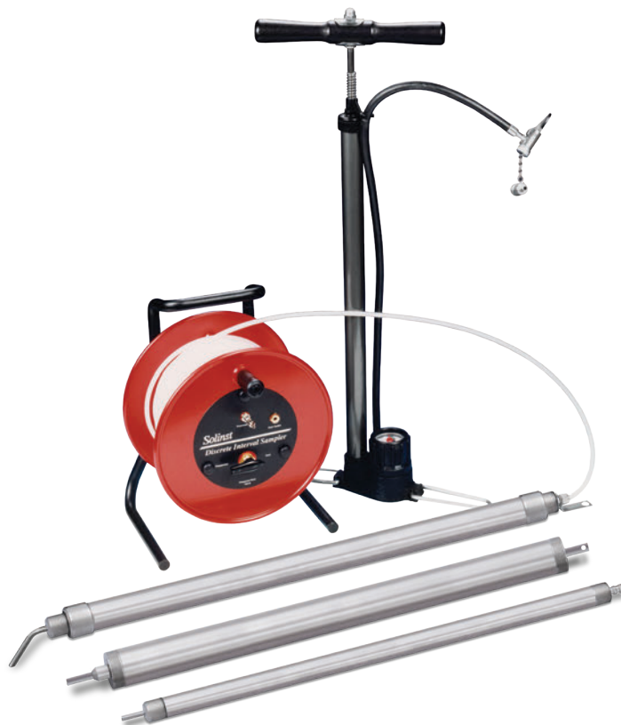
2", 1.66" and 1"ø Discrete Interval Samplers with High Pressure Hand Pump

These sampling methods are based on the principle that groundwater which flows through a screen and into a well, maintains equilibrium with the adjacent water bearing unit. Sampling at the screened interval should result in representative samples, without the need for purging.