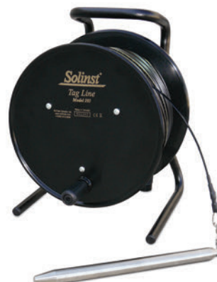
Tag Line / Suspension Cable