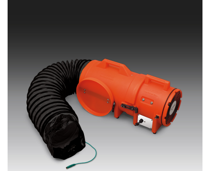
9538 (Blower only), 9538-15, 9538-25