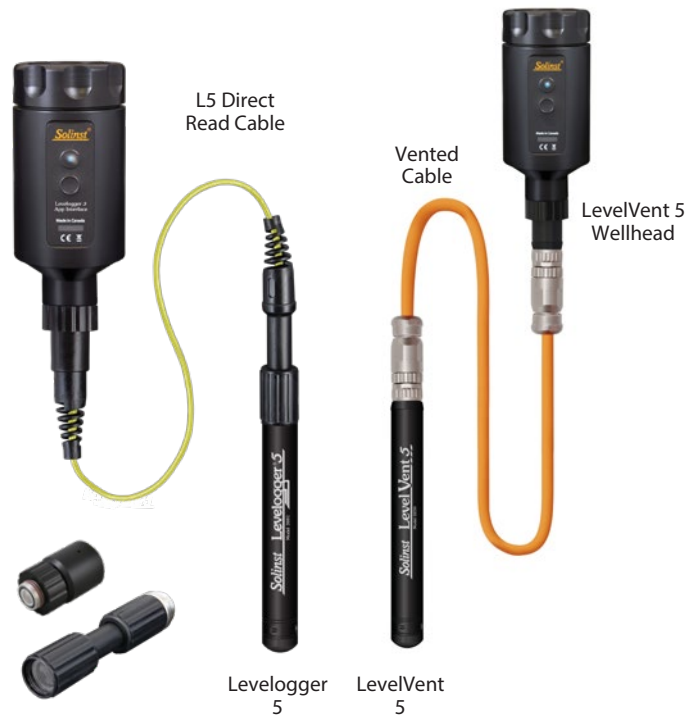
L5 Threaded and Slip Fit Adaptors allow you to directly connect your Levellogger to the Levellogger 5 App Interface.