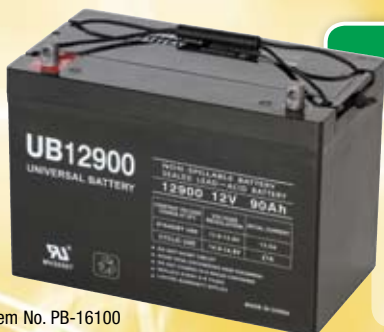
Item No. PB-16100

310% longer lasting than a standard 12 volt car battery