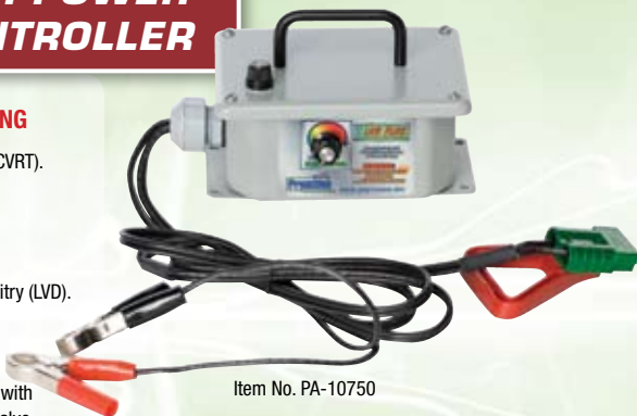
Item No. PA-10750