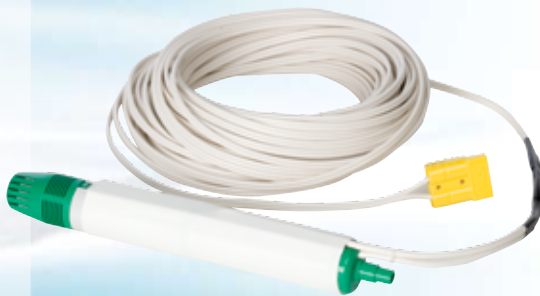
Item No. P-10350