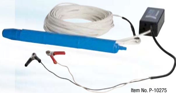
Item No. P-10275

Not Compatible with any of ProActive's Controllers