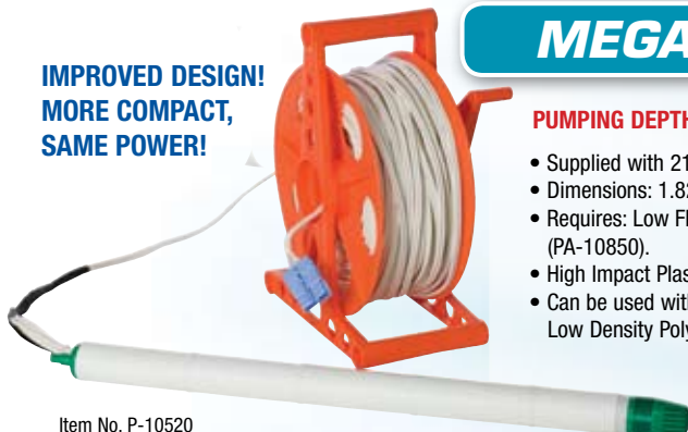
Item No. P-10520

IMPROVED DESIGN! MORE COMPACT, SAME POWER!