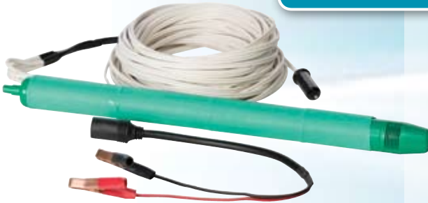
Item No. P-10300