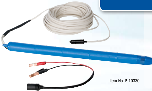
Item No. P-10330