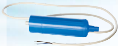
Item No. P-10000

NOT COMPATIBLE WITH ANY OF PROACTIVE'S CONTROLLERS