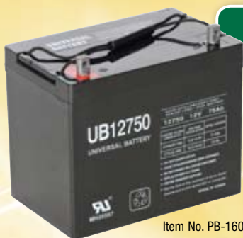
Item No. PB-16090

200% longer lasting than a standard 12 volt car battery