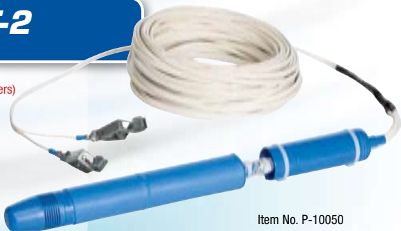
Item No. P-10050

NOT COMPATIBLE WITH ANY OF PROACTIVE'S CONTROLLERS.