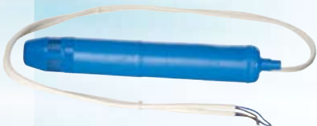
Item No. P-10010

NOT COMPATIBLE WITH ANY OF PROACTIVE'S CONTROLLERS.