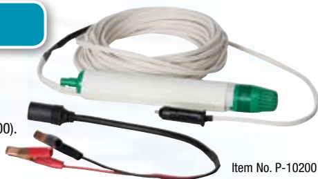
Item No. P-10200