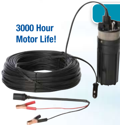
Item No. P-10380