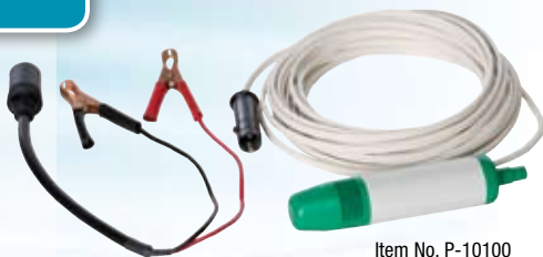
Item No. P-10100