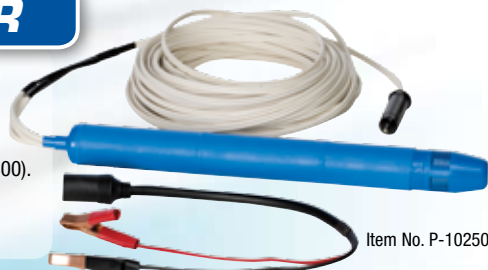
Item No. P-10250