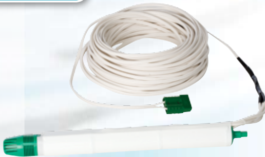
Item No. P-10400