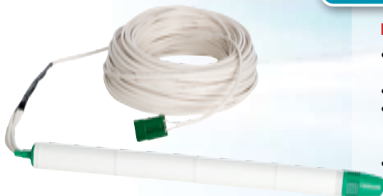
Item No. P-10500