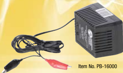
Item No. PB-16000