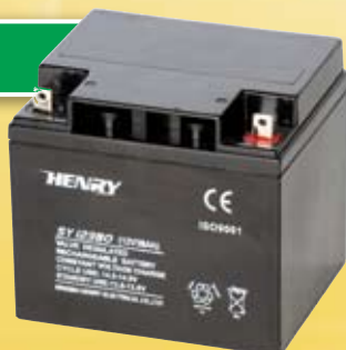
Item No. PB-16070