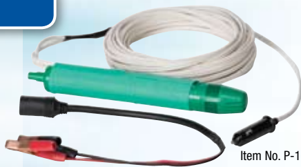
Item No. P-10150