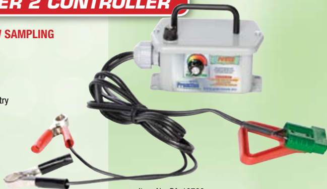
Item No. PA-10700