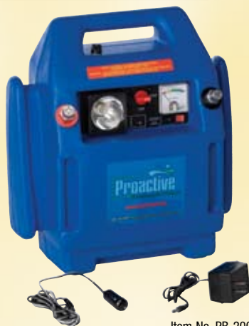
Item No. PB-20010

Proactive 38 Amp Mobile Battery Power Packs is a compact, durable and portable 12 volt system specifically designed for Proactive's Standard and Water Spout pump line. This self-contained, rechargeable 12 volt system can very easily replace gas generators or your old car battery.