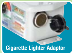
Cigarette Lighter Adaptor