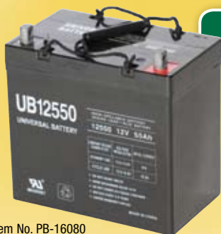
Item No. PB-16080