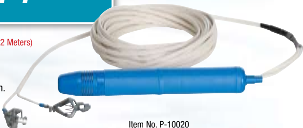
Item No. P-10020

NOT COMPATIBLE WITH ANY OF PROACTIVE'S CONTROLLERS.