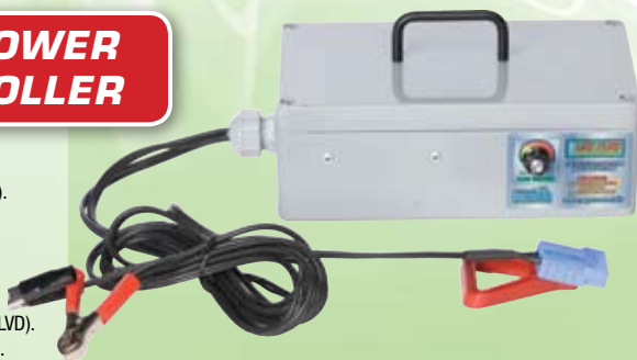
Item No. PA-10850